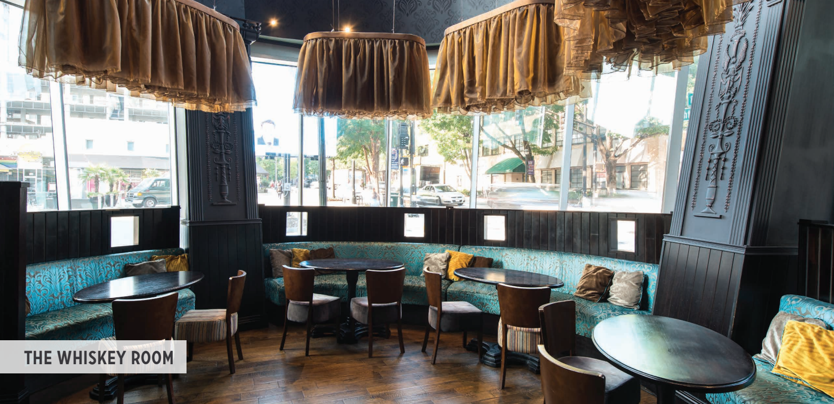
THE WHISKEY ROOM