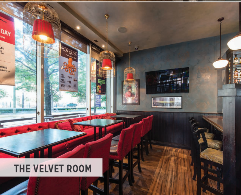
THE VELVET ROOM