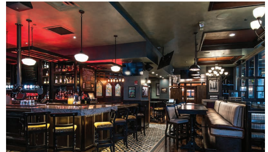
THE WHOLE SHEBANG

FOOD & EVENT SPACE PHOTOS: WWW.FADOIRISHPUB.COM/ATLANTA-MIDTOWN/PUB-GALLERY