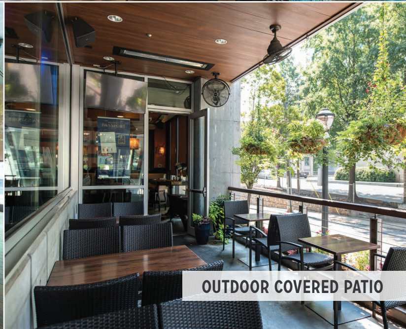
OUTDOOR COVERED PATIO