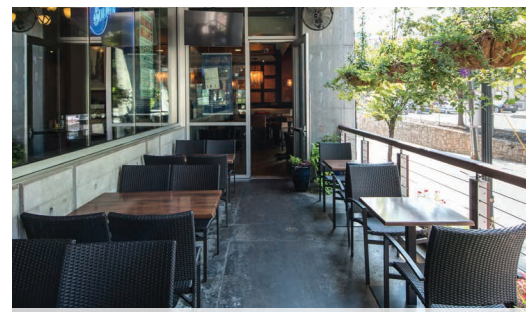
OUTDOOR COVERED PATIO