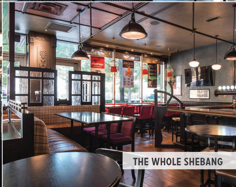
THE WHOLE SHEBANG