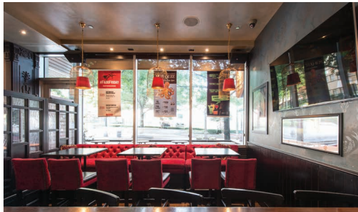
THE VELVET ROOM