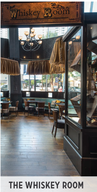
THE WHISKEY ROOM